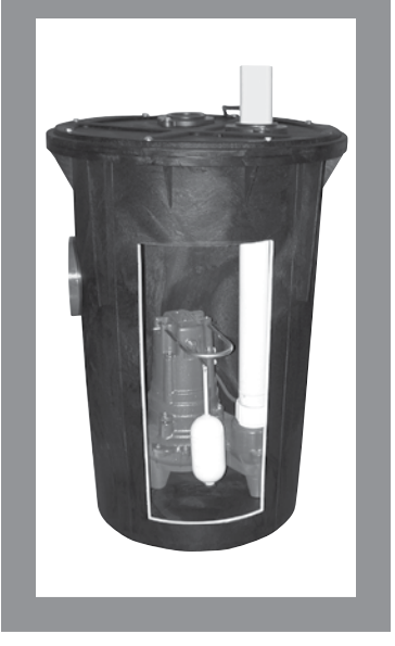
Products may not be exactly as pictured.